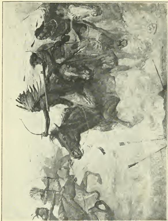
AS THEY SWEEP PAST US THEY SHOT THEIR ARROWS